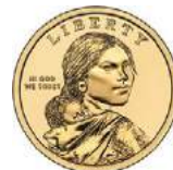
Dollar coin = 100¢

*Note: Due to changes in bills and coins over the years, you may see bills or coins that look slightly or very different. Always pay attention to what each bill or coin says.