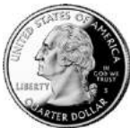
Quarter – 25 ¢