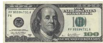
One Hundred Dollars

United States coins (¢) have names marked on them, not numbers. Coins have different denominations and various sizes. The most common coins are shown here: