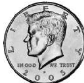
Half Dollar = 50¢