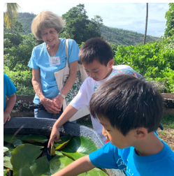
Manoa Heritage Center