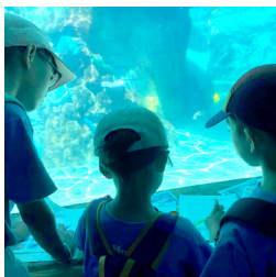
Sea Life Park