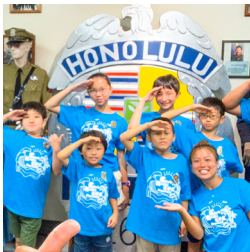
Honolulu Police Department & Discovery Center