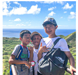
Diamond Head Hike