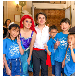
DISNEY'S The Little Mermaid