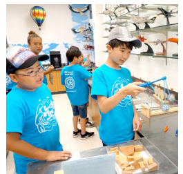
Planetarium & Science Experience