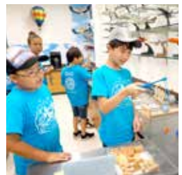
Planetarium & Science Experience