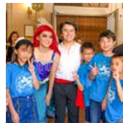
DISNEY'S The Little Mermaid