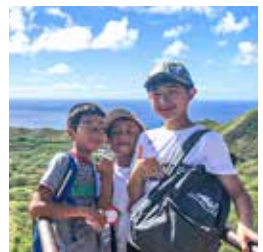
Diamond Head Hike