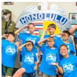
Honolulu Police Department & Discovery Center