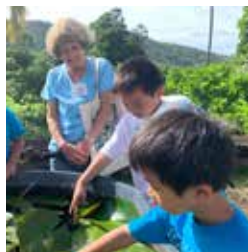
Manoa Heritage Center