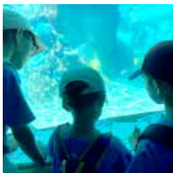
Sea Life Park